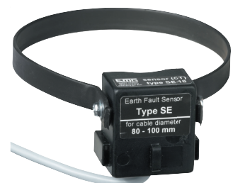
Sensor type SE